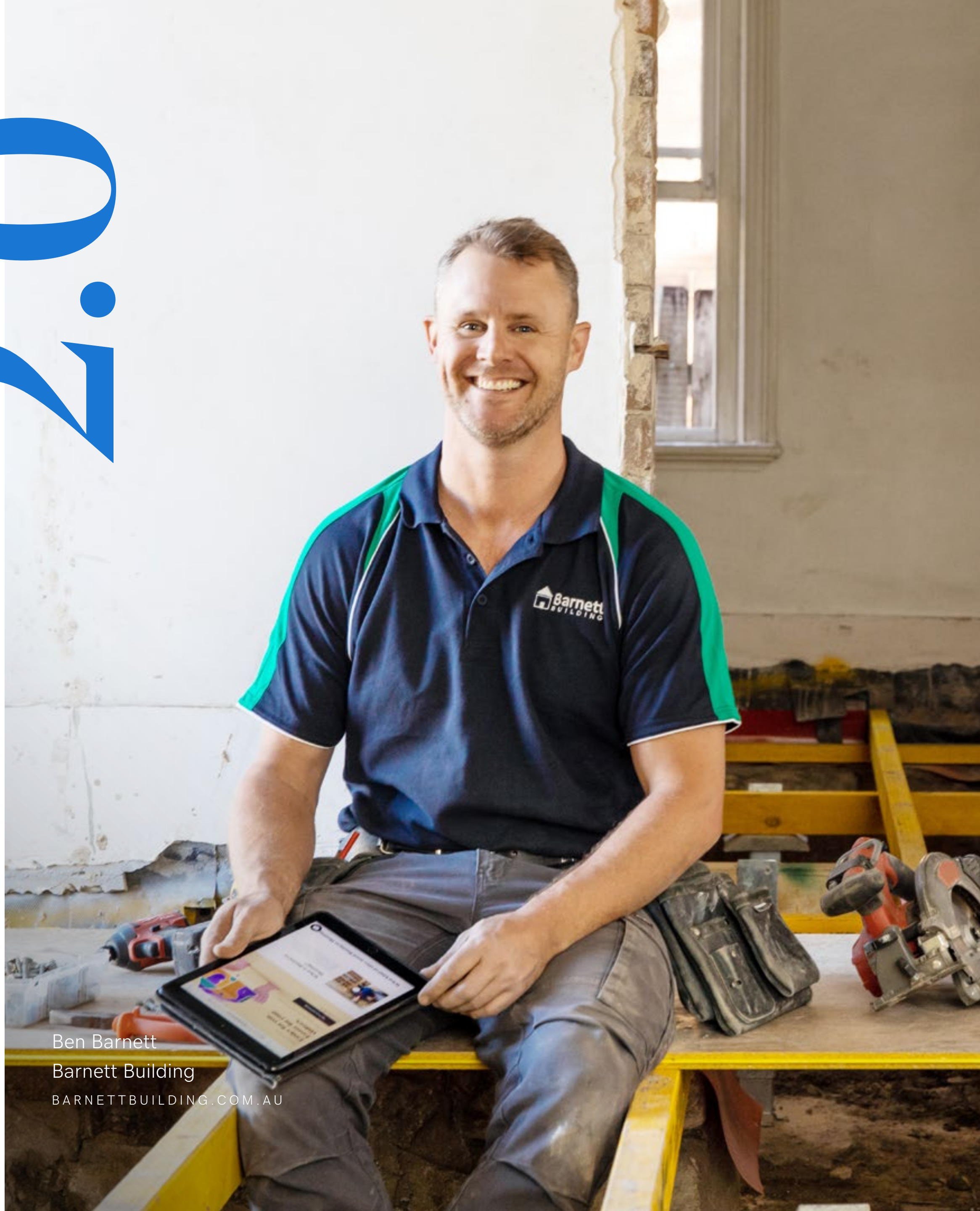
Ben Barnett Barnett Building BARNETTBUILDING.COM.AU